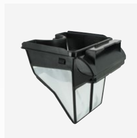
Filter canister filter: 100 µ